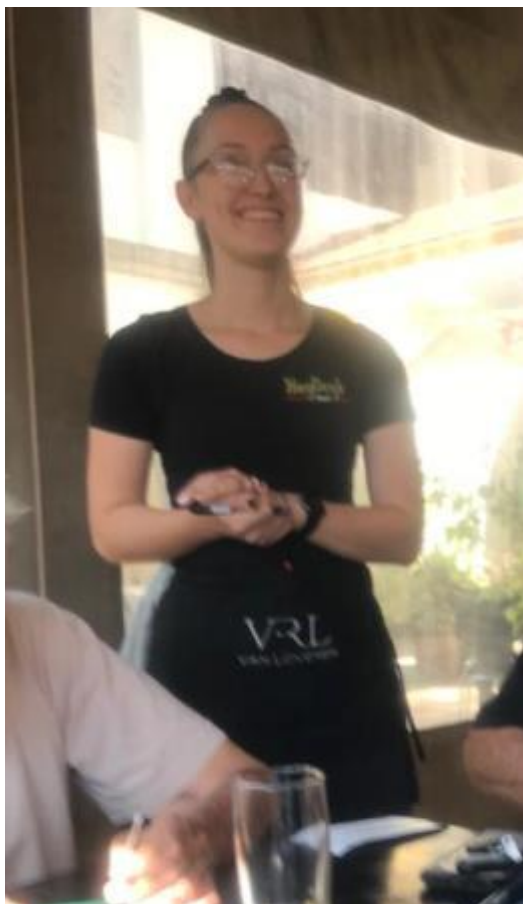
Our efficient smiling waitress.