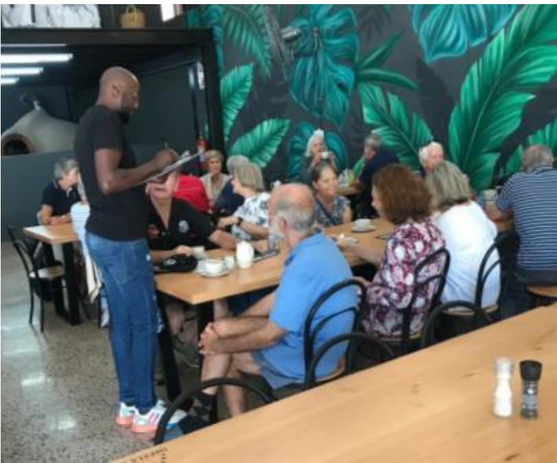
Breakfast orders being taken