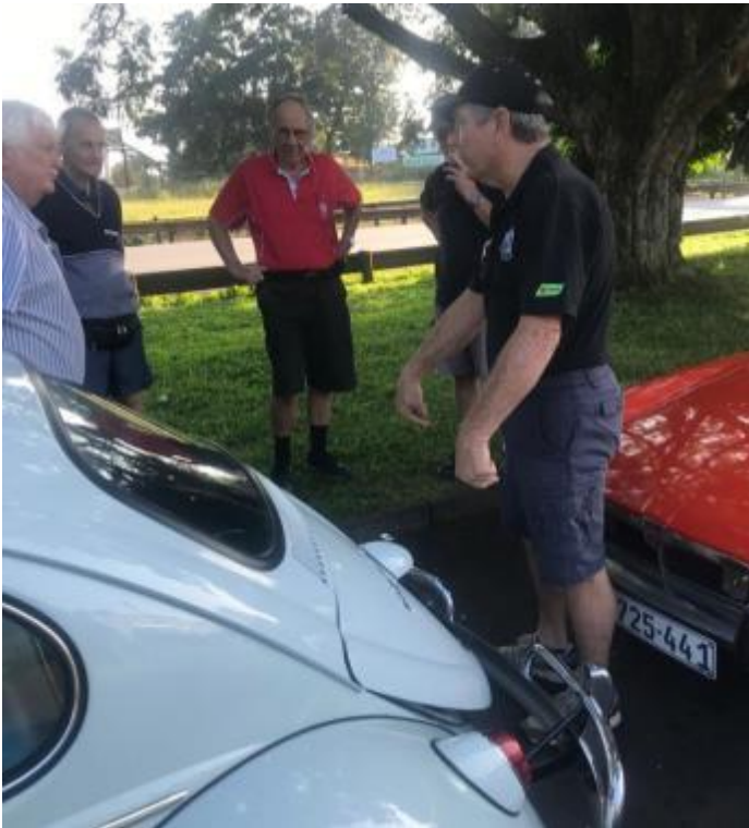
MG Special and lots of chatting!!