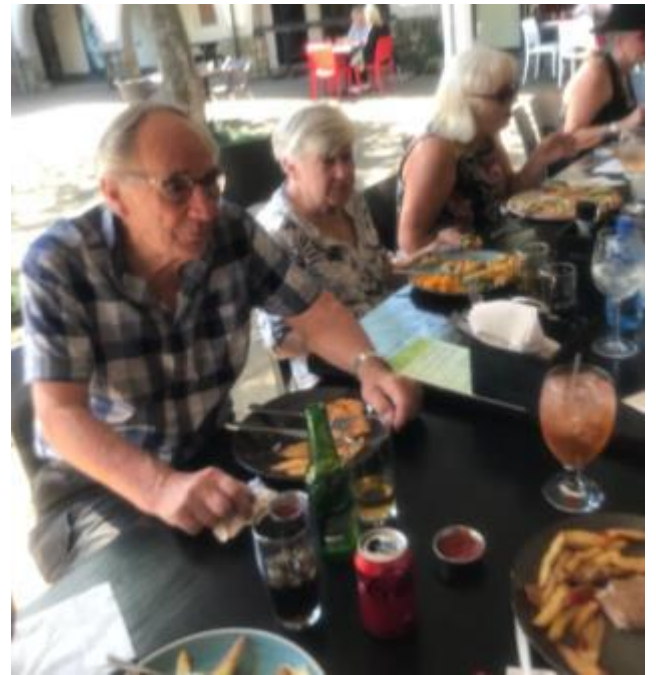
Members enjoying good food and a couple of refreshments !!