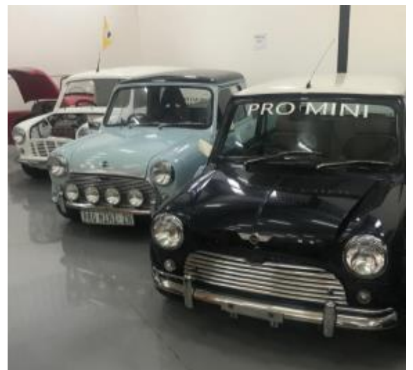
In the museum there were over 1000 motor bikes (mostly modern)