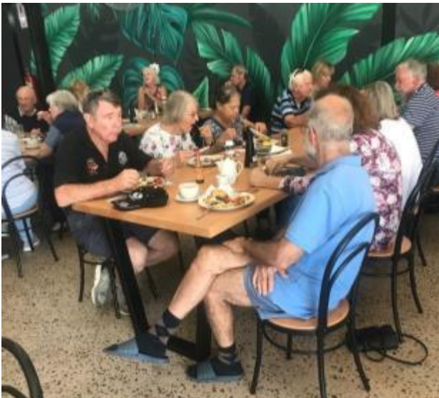
More happy munchers!!