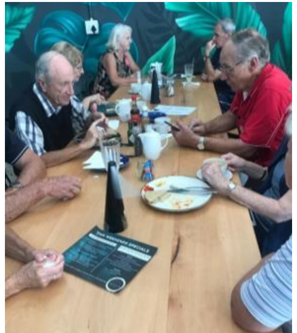
Breakfast being consumed