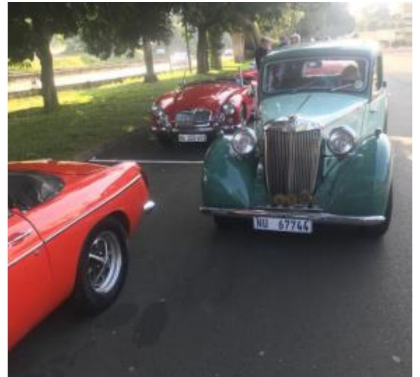
Some of the cars waiting for the off!!