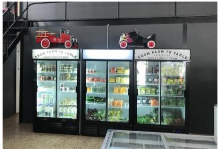
Shop inside the restaurant