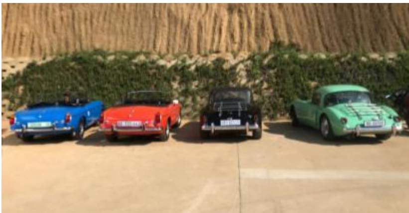
In the parking lot outside the restaurant