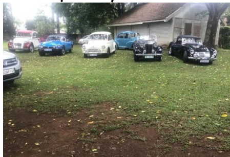
All sorts of cars on the day

As this was the 34 th running of the event and in order to make organizing such an event more worthwhile, we invited the 2CV, and the Morris Minor club to join us. Consequently we had 20 odd cars and 44 people. Our biggest turn out for ages.