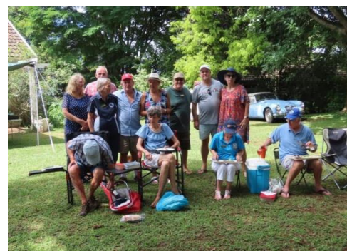
Members of all three clubs enjoying the braai / barbeque !!