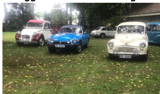
The three clubs invited!