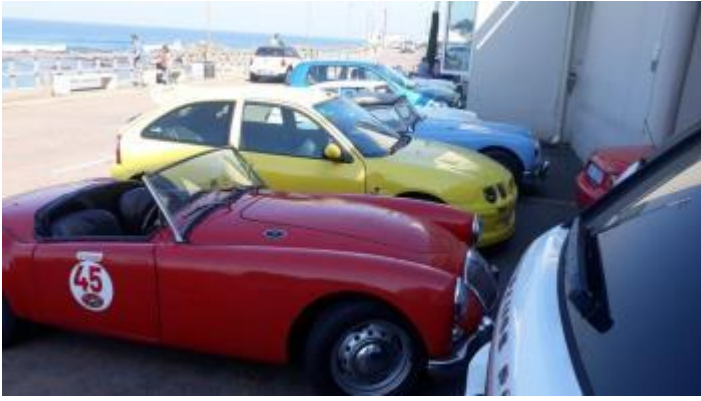
Some of the cars