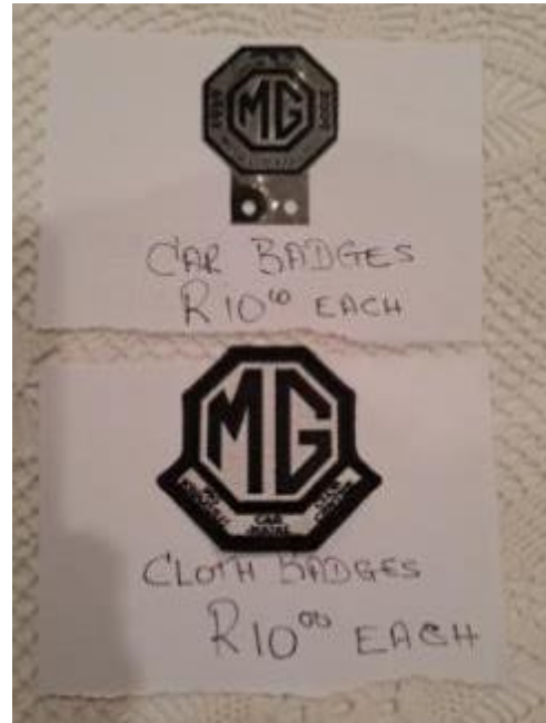
Metal Car Badges / Cloth Badges