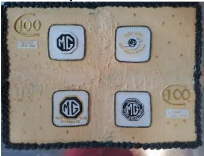
Close up of the main cake!