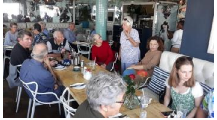
Members enjoying the day!!