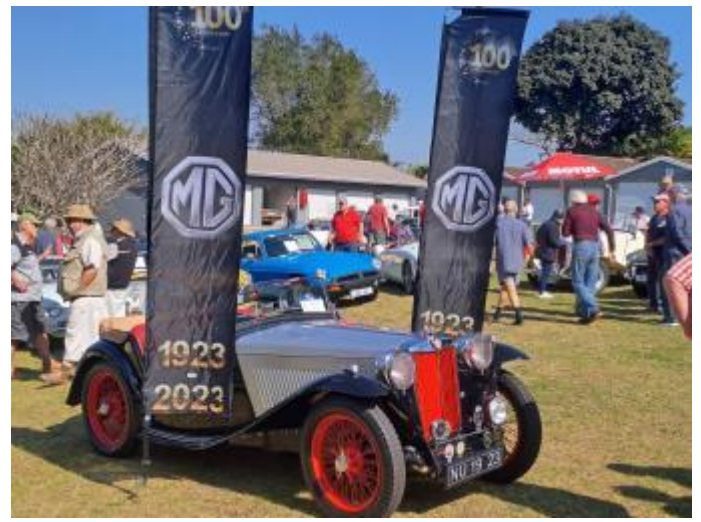
Trevor Burnett's TC won car of the day!!