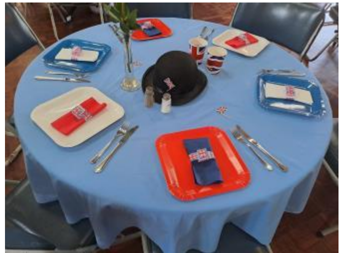
Tables were beautifully set up