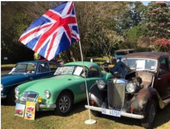
The Sysum cars!!