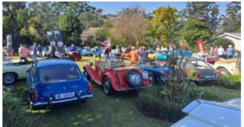
The MG's took up center stage (33 cars in total!!)