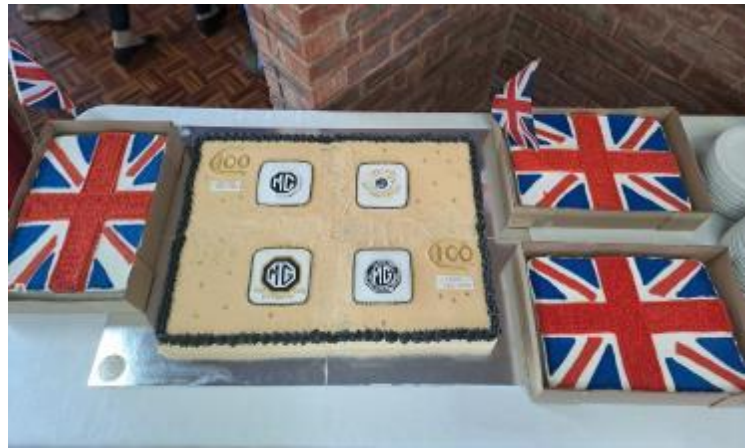
The cakes we had made fed all!