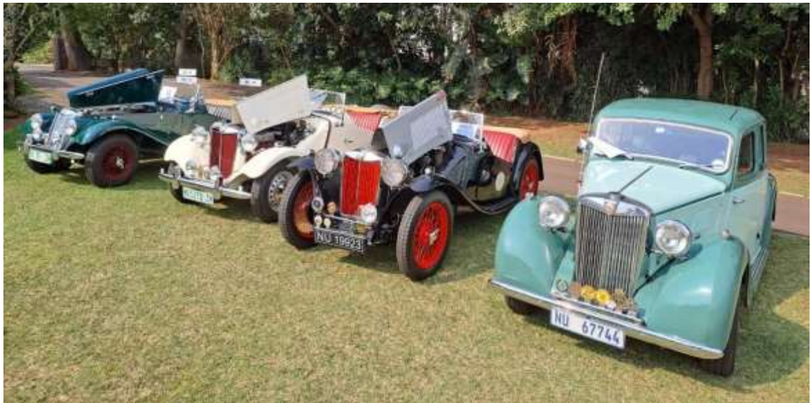
TF 1500, TD, TC, Y Type