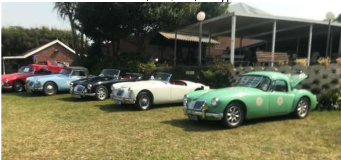
Most of the MGA's