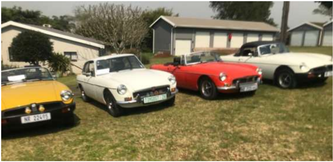
Some of the B's