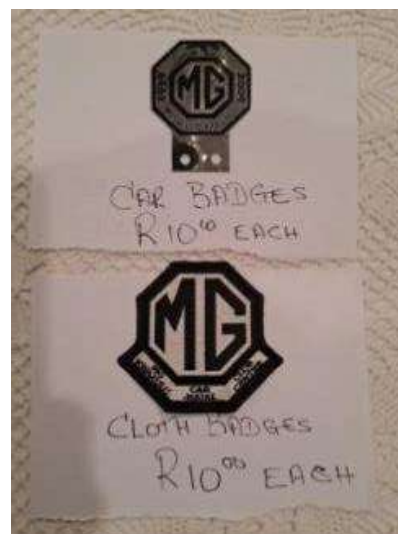
Metal Car Badges / Cloth Badges