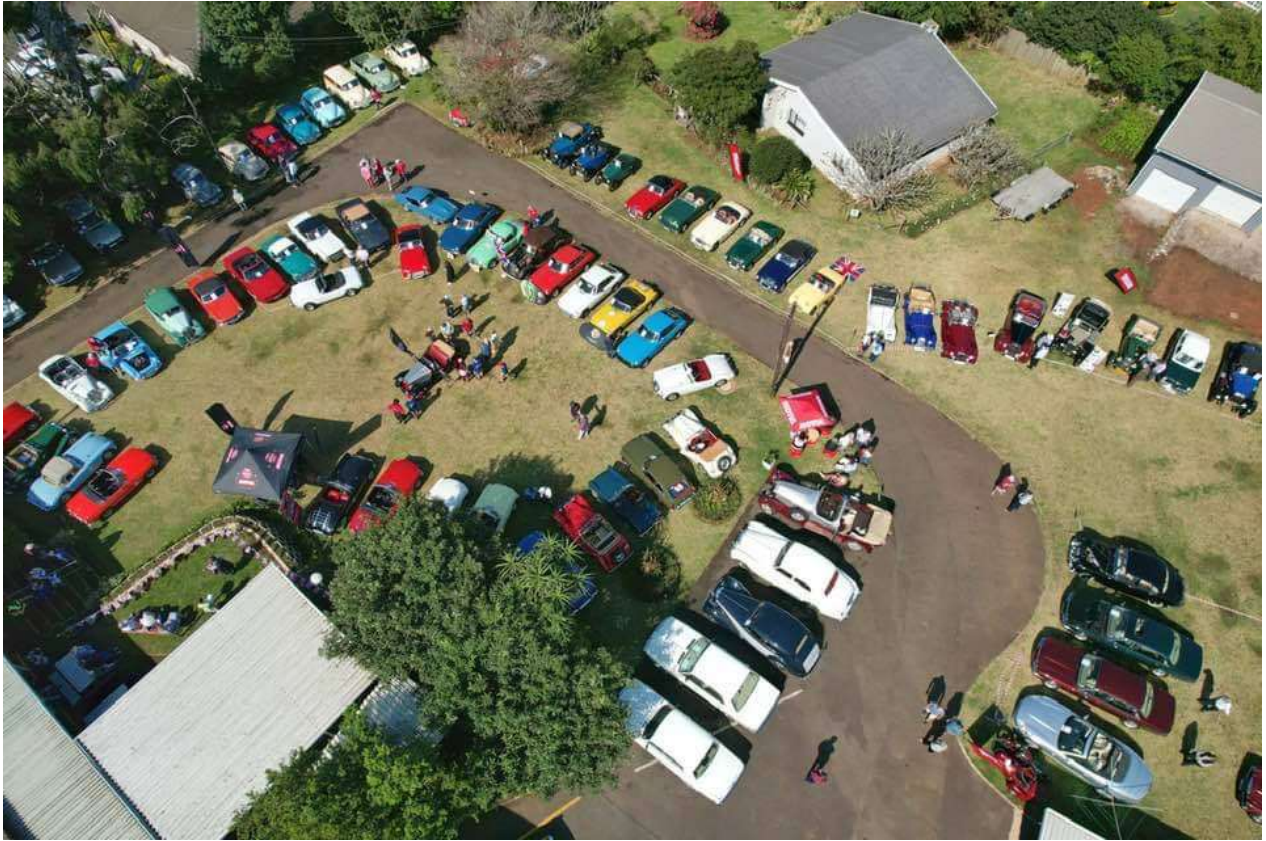
The MG's took up center stage (33 cars in total!!)